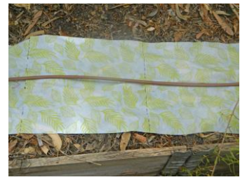
Wetted reusable plant towels under dripline

It is recommended that you use mulch to minimise evaporation from the polyester fabric or the reusable plant towels.