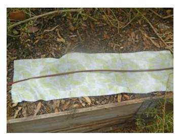
Reusable plant towels starting to wet under dripline