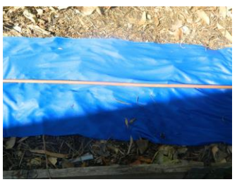
30cm strip of wetted polyester fabric