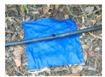
30cm x 30cm wetted polyester fabric