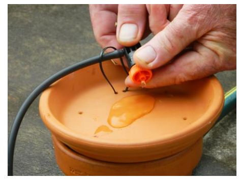
The control dripper is adjustable.

It is important to note here that the control dripper is adjustable. If you reduce the flow rate of the control dripper, it takes a lot longer for the control volume of water to drip into the pot and so the duration of the irrigation event increases and your plants get more water. On the other hand, if you increase the flow rate of the control dripper, the control volume of water drips into the pot more quickly and so the duration of the irrigation event decreases and your plants get less water. Adjust the control dripper so that the irrigation delivers the appropriate amount of water to your plants at their current stage of growth.