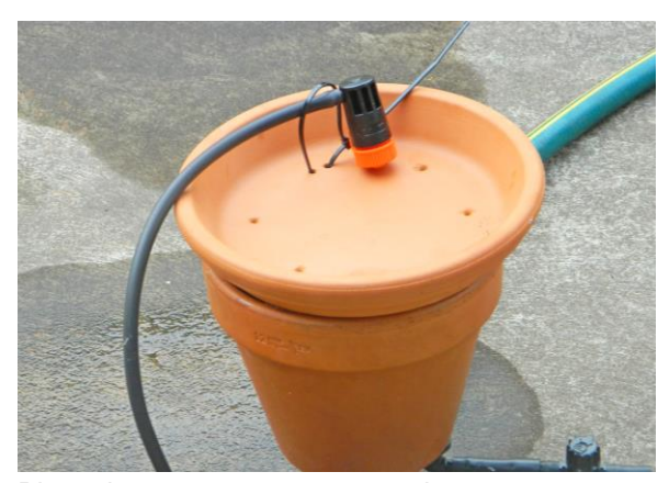
Place the terracotta saucer on the terracotta pot so that the control dripper drips water into the pot