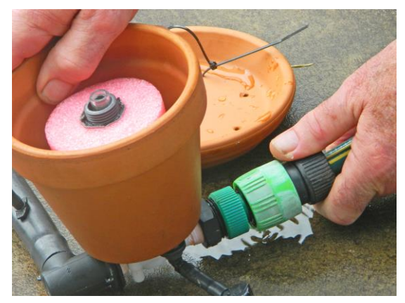
Connect the water supply to the valve inlet

Connect the control dripper to the irrigation application. Place the terracotta saucer on the terracotta pot so that the control dripper drips water into the pot. The control dripper should be at the same level as the irrigation drippers in your application.