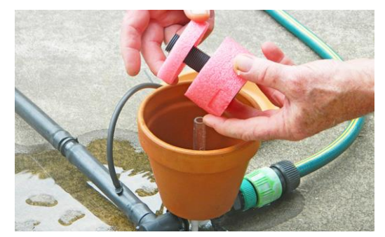
To adjust the interval between irrigation events, adjust the gap between the upper and lower floats

Adjusting the interval between irrigation events does not change the water usage rate. For example, if you decrease the interval between irrigation events by increasing the gap between the upper and lower floats, the amount of water used during the irrigation event increases automatically to ensure that the water usage rate (litres per week for example) remains the same.