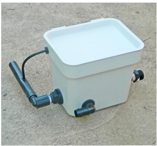
Unpowered Drip Irrigation Clay Pot Controller