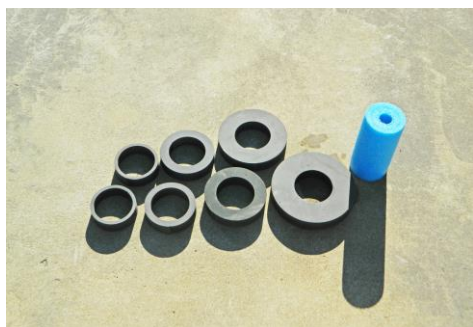
Cylindrical float and seven float rings

To increase the options for the irrigation frequency, the DIY Unpowered Evaporative Valve Kit is provided with an adjustable float consisting of a 7 cm diameter cylindrical float and 7 float rings that can slide over the cylinder to increase the outside diameter of the float (the bottom of the float ring should align with the bottom of the cylindrical float).