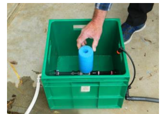
Slide the cylindrical float over the float shaft

Step 12. Slide the cylindrical float shaft over the float shaft.