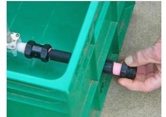
Attach the inlet adaptor to the inlet pipe

Step 7. Attach the inlet adaptor to the inlet pipe (use teflon tape). Note that the inlet side of the valve extends farther than the outlet side.