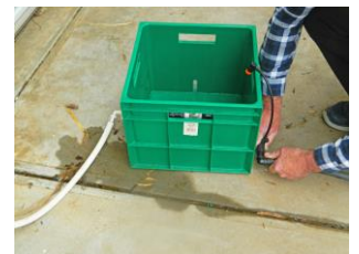
Connect the irrigation system to the outlet side of the evaporator

Step 10. Connect the irrigation system to the outlet side of the evaporator.