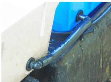
Connecting two evaporators

You can decrease the surface area of evaporation by placing full bottles of water in the evaporator.