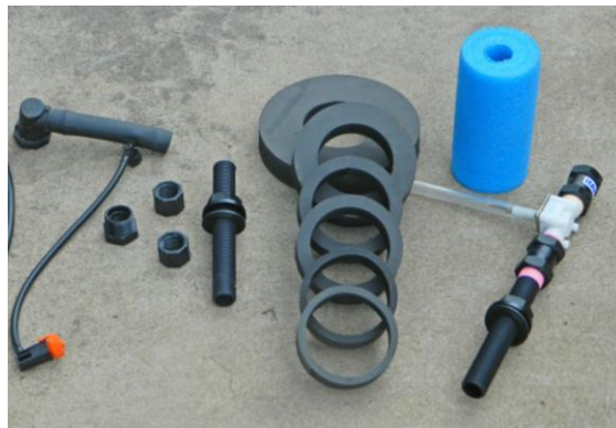
Components in the Kit

Step 1. Choose a suitable evaporator. The evaporator is a plastic container with vertical sides with an opening of at least 20cm x 20cm and a height of at least 15cm (a hobby box is ideal).