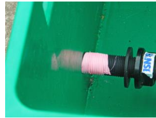
Wrap teflon tape around the inlet and outlet pipe

Step 6. Wrap teflon tape around the inlet pipe and the outlet pipe as close as possible to the sides of the evaporator. To prevent water leaking from the evaporator, tighten the internal backing nuts against the external round plastic nuts.