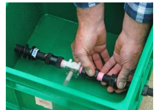
Connect the inlet pipe to the valve assembly

Step 5. Connect the outlet pipe to the valve assembly (use teflon tape).