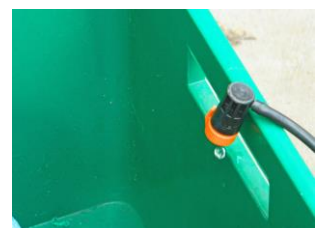
Adjust the control dripper so that water drips into the evaporator

Step 14. Adjust the control dripper so that water drips into the evaporator.