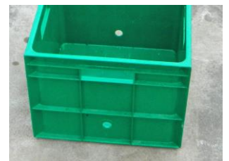
Drill 2 holes in opposite sides of the evaporator

Step 2. Drill two 20mm holes opposite each other in opposite sides of the evaporator. The centres of the holes should be no more than 5cm higher than the bottom of the evaporator.