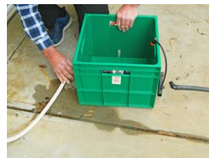
Connect the water supply to the inlet side of the evaporator

Step 9. Connect the water supply to the inlet side of the evaporator.