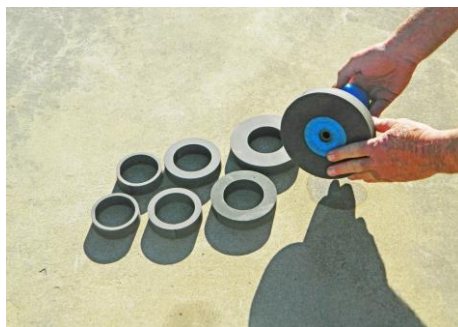
Slide the float ring over the cylindrical float

The following table shows the irrigation frequency for various float rings. The irrigation frequency is determined by the net evaporation from the evaporator between irrigation events.