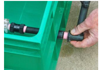
Attach the adjustable control dripper assembly to the outlet pipe

Step 8. Attach the adjustable control dripper assembly to the outlet pipe (use teflon tape).