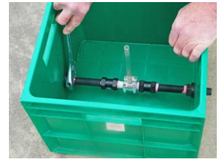
Tighten the internal backing nuts against the external round plastic nuts

Step 7. Attach the inlet adaptor to the inlet pipe (use teflon tape). Note that the inlet side of the valve extends farther than the outlet side.