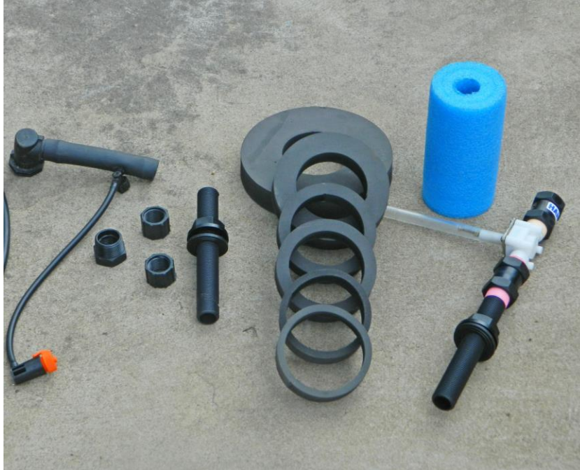
DIY Unpowered Evaporative Valve Kit