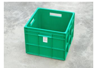
A hobby box makes an ideal evaporator

Step 1. Choose a suitable evaporator. The evaporator is a plastic container with vertical sides with an opening of at least 20cm x 20cm and a height of at least 15cm (a hobby box is ideal).