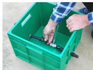
Insert the outlet pipe through the other hole

Step 4. Insert the outlet pipe through the other hole in the evaporator so that the washer is inside the evaporator. Attach the other round plastic nut.