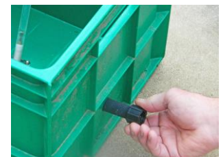
Attach a round plastic nut

Step 4. Insert the outlet pipe through the other hole in the evaporator so that the washer is inside the evaporator. Attach the other round plastic nut.