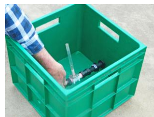
Insert the inlet pipe through one of the holes

Step 3. Insert the inlet pipe (connected to the valve assembly) through one of the holes in the evaporator and attach one of the round plastic nuts.