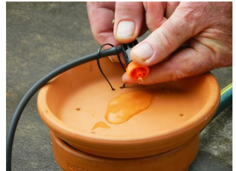
The control dripper is adjustable.

It is important to note here that the control dripper is adjustable. If you reduce the flow rate of the control dripper, it takes a lot longer for the control volume of water to drip into the pot and so the duration of the irrigation event increases and your plants get more water. On the other hand, if you increase the flow rate of the control dripper, the control volume of water drips into the pot more quickly and so the duration of the irrigation event decreases and your plants get less water. Adjust the control dripper so that the irrigation delivers the appropriate amount of water to your plants at their current stage of growth.