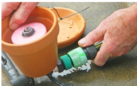
Connect the water supply to the inlet

Connect the water supply from the header tank to the inlet pipe and connect the irrigation application to the outlet pipe (note that the control dripper is connected to the outlet pipe).