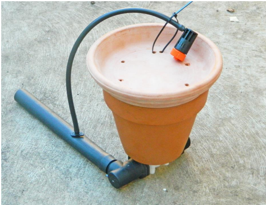
Unpowered Terracotta Irrigation Controller