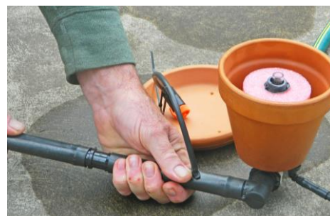
Connect the irrigation application to the outlet