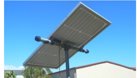
Solar panel mounted on a pole

A 12 volt 40 watt solar panel should provide all the power required.