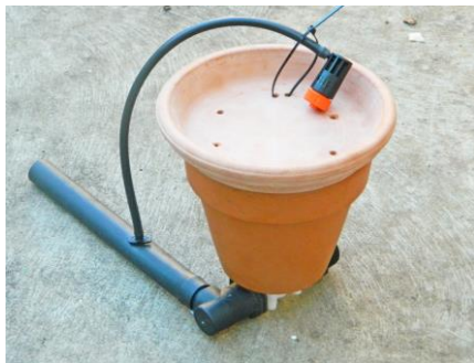
Unpowered Terracotta Irrigation Controller

As well as the User Manual, the kit includes the following two components: