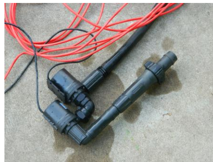
Double pump (two 19 watt pumps connected in series) with an inlet filter, fittings to connect to 19 mm poly pipe, and 9 metres of waterproof electrical cable

You will need to purchase a 40 watt solar panel to connect directly to the pump (no battery required)