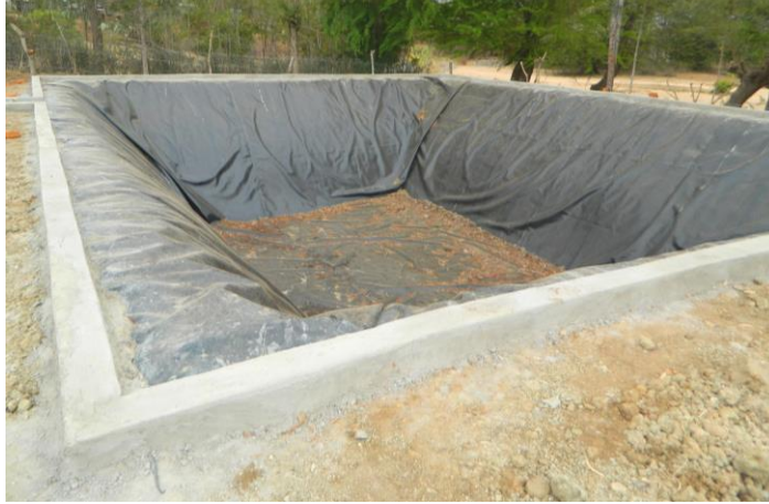
Farm pond in Kenya for gravity feed drip irrigation

It is assumed that the bottom of the farm pond is no more than 4 metres lower than the irrigation drippers. The water supply pressure from the header tank should be at least 1 metre head.