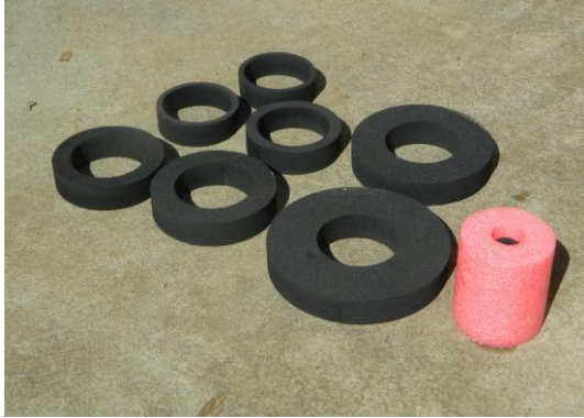
Cylindrical float and seven float rings

To increase the options for the irrigation frequency, the DIY Unpowered Evaporative Valve Kit is provided with an adjustable float consisting of a 7 cm diameter cylindrical float and 7 float rings that can slide over the cylinder to increase the outside diameter of the float (the bottom of the float ring should align with the bottom of the cylindrical float).