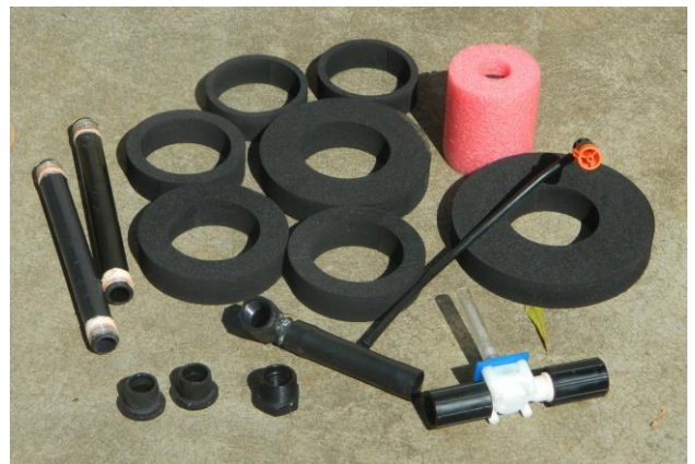
Components in the Kit

Step 1. Choose a suitable evaporator. The evaporator is a plastic container with vertical sides with an opening of at least 30cm x 30cm and a height of at least 12cm.