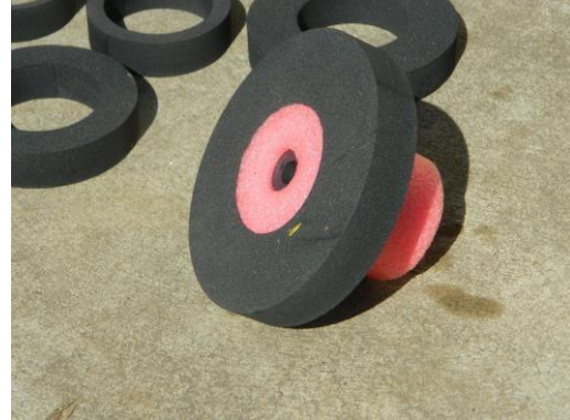
Slide the float ring over the cylindrical float

The following table shows the irrigation frequency for various float rings. The irrigation frequency is determined by the net evaporation from the evaporator between irrigation events.