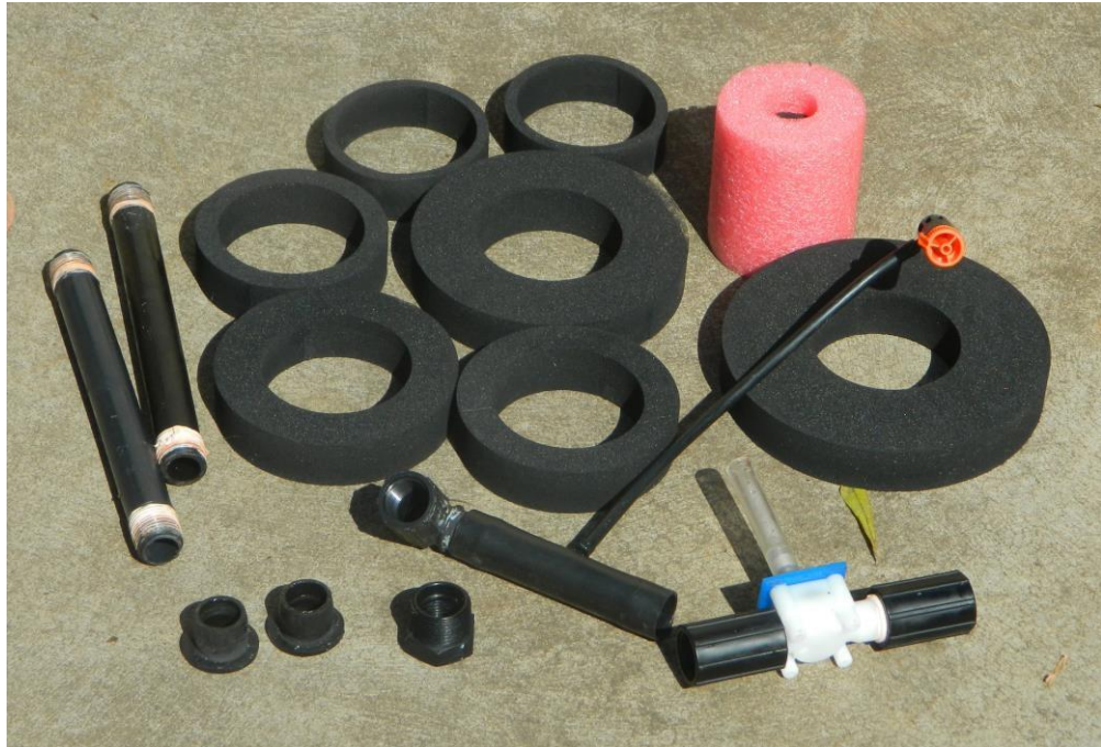
DIY Unpowered Evaporative Valve Kit